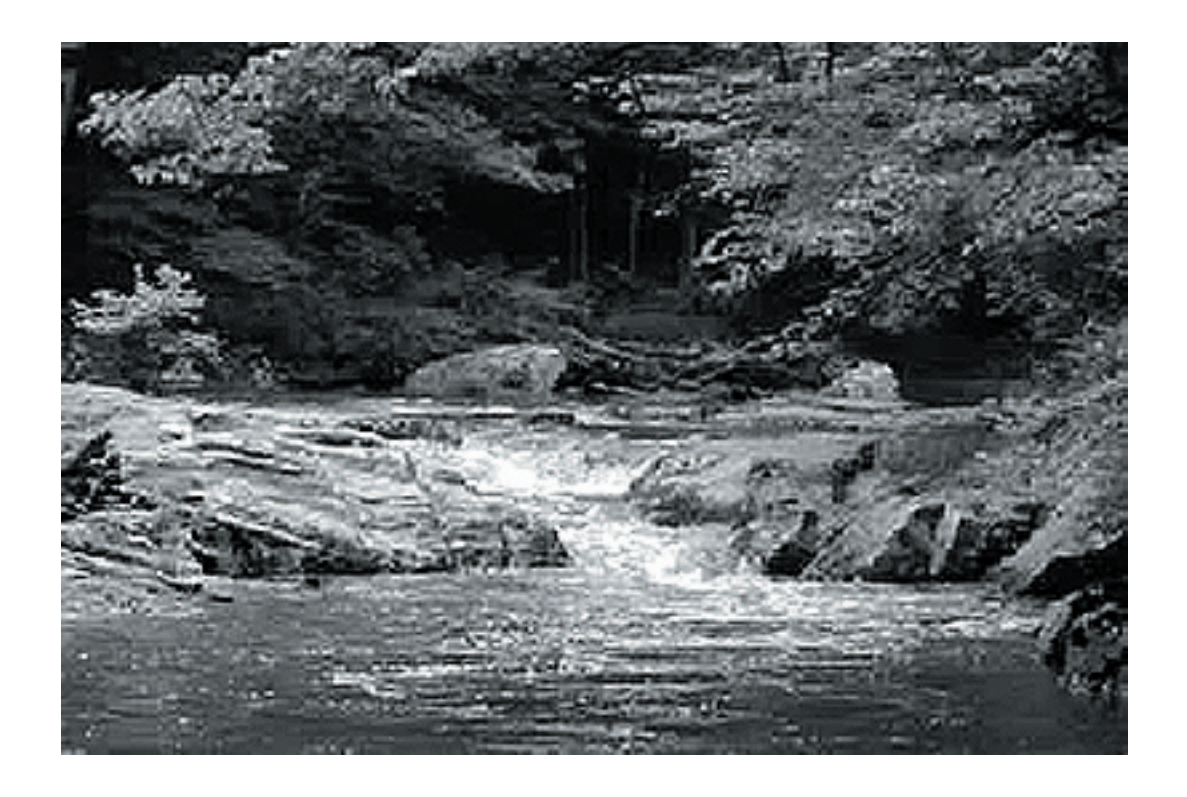
precipitation : any form of water that falls from clouds onto Earth's surface

The water cycle is important to all living things. Without the continuous return of fresh water to the land, plants and animals couldn't exist. If you have been in the desert without water for a couple of days, and someone offers you gold or a nice cool drink, which would you choose? Like Gramps said, "Water is much more precious than gold!" If we don't use it wisely we won't have enough to go around. We can't create more water. The water that was here for the dinosaurs is all that's available for the people on our planet today. We always need to be thinking of ways to save our precious "liquid gold: water." "Waste not, want not!" Grandpa said.