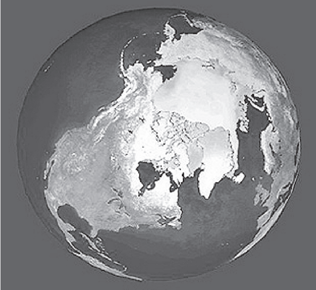
Earth's Ice Cap

When I look at a world globe, it seems as though much of our planet is covered with water. Grandpa explained that three-fourths of Earth is covered with water. But the amount of water we can use is small. Most of Earth's water is in the ocean or frozen in the polar ice caps. Just