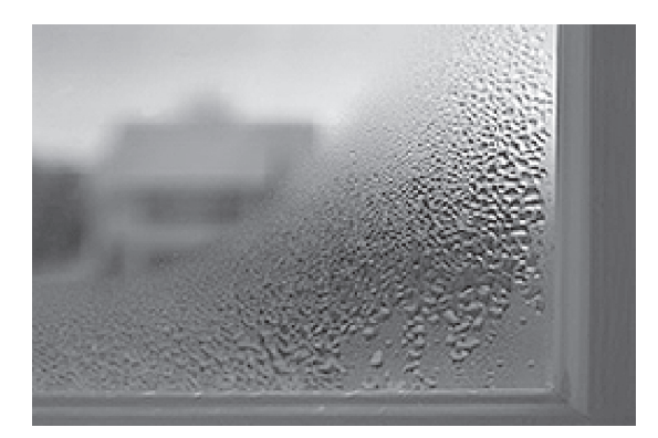
Condensation on a window

Condensation can be observed on a cloudy bathroom mirror. Taking a bath or shower puts a lot of water vapor into the air. When water vapor hits the cold surface of the mirror, the little particles in the air collect on the surface of the mirror and turn back to liquid as tiny water droplets. Think about a tall glass filled with ice cubes and frosty lemonade. In a little while water vapor in the air will condense on the outside of the glass because the glass is very cold. This means there is water vapor in the air. When this water vapor hits any cold surface, water particles will form water droplets on the object. You have probably seen dew on your lawns on some mornings. The ground was cold enough to condense the water vapor